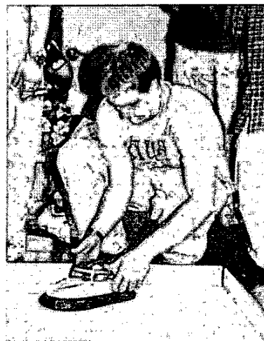
Fig. 8: Freshmen student that converted his TekBot into a hovercraft.

Figures 8 and 9 illustrate innovations by two of our freshmen. In Fig. 8, the student took his toy hovercraft and modified it to house the TekBot. In Fig. 9, the student created the BeaverBot. The school fight song is currently being programmed into the BeaverBot so that it will "sing" the fight song and synchronously dance to it.