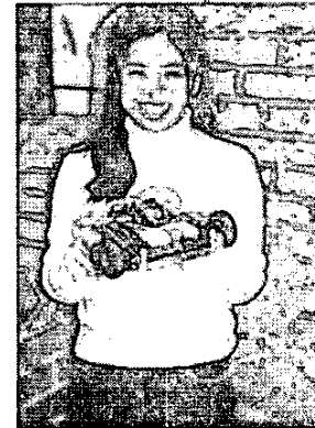
Fig. 4: TekBot robot platform with whiskers and add-on breadboard.