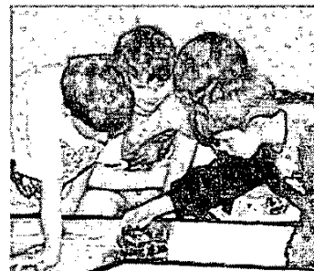
Fig. 7: Young kids find the robot competition fun and look forward to being engineers.