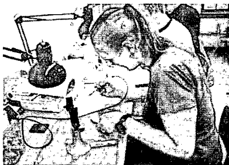
Fig. 5: Student in the freshmen laboratory working on troubleshooting part of the robot.

Group exercises were also created for the lab experiments. These group labs required that students interact with each other in order to accomplish a goal. Group labs are intended to be low pressure placing emphasis on interaction and learning.