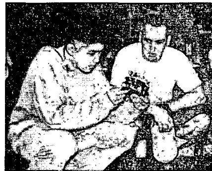
Fig. 6: Upper class students mentor freshmen in ECE 112.

The competition is open to the public. As shown in Fig. 7, future engineers enjoyed the display and competition as much as the college students.