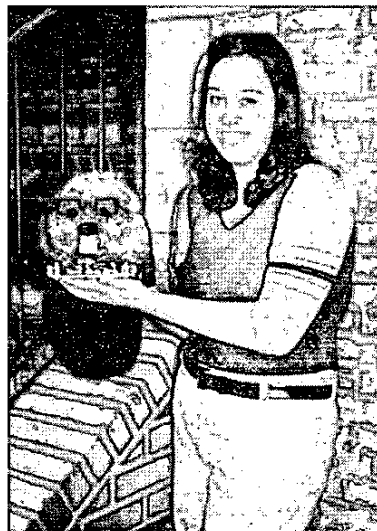
Fig. 9: Freshmen student that invented the BeaverBot.